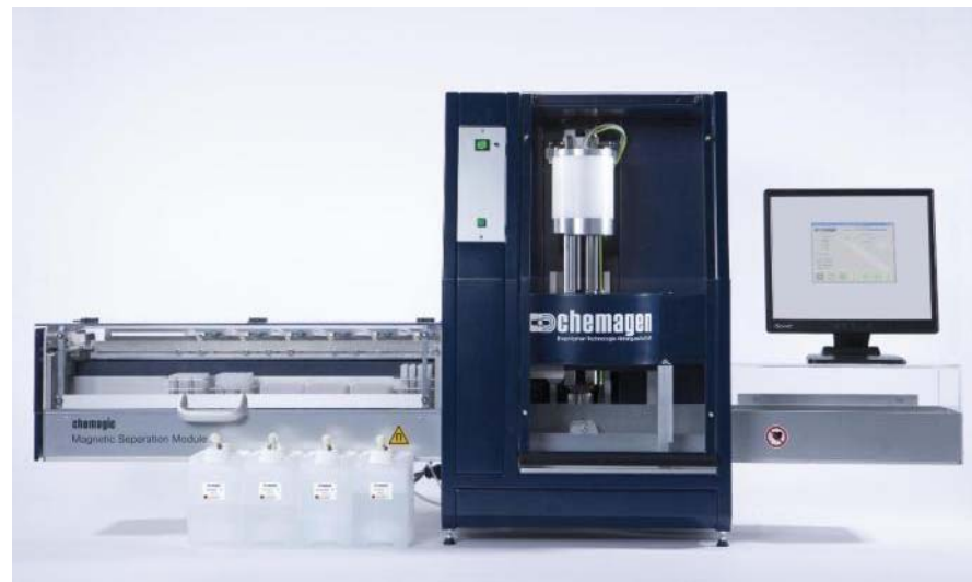
chemagic Dispenser chemagic MSM I chemagic QA Software

Improve the safety of the entire process by using the chemagic QA software, which tracks every single step.