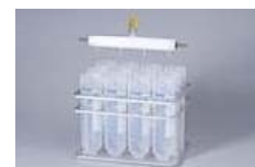
chemagic 24 Rod Head