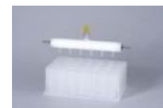
chemagic 96 Rod Head