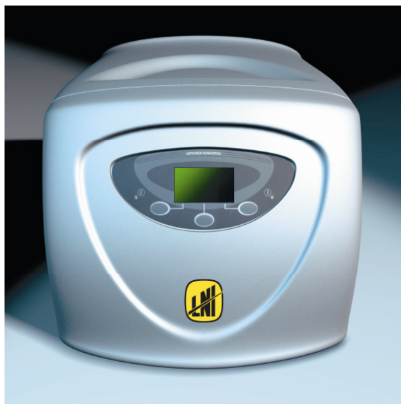
Table top Nitrogen Generator Need external source of compressed air